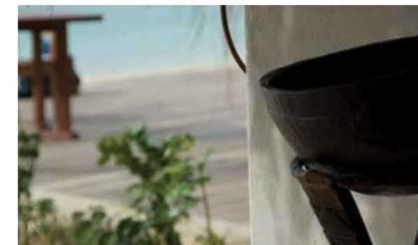
Design: Tin Shack Design Co. (011 467 6377) E & OE.

More Information: E-mail enquiry@azura-retreats.com . Web: www.azura-retreats.com